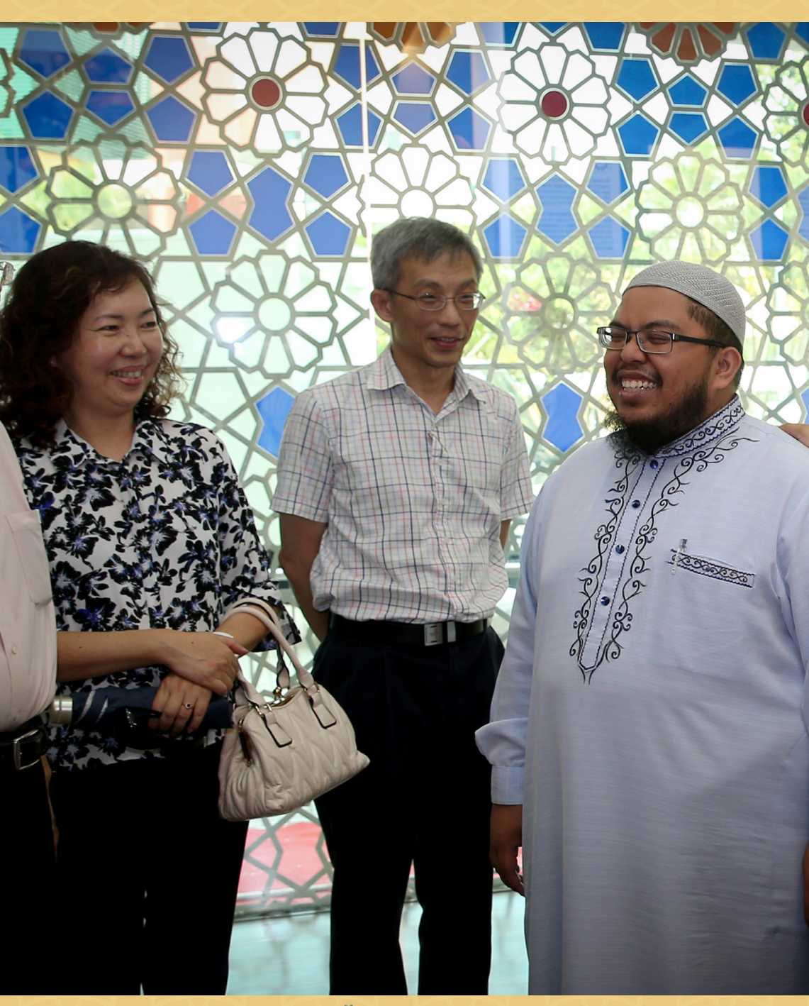
42 CONTEMPORARY IRSYAD SERIES * SOCIAL INTERACTIONS